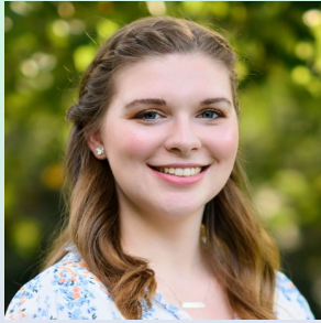
Mary Bonney Calvert Peace Project